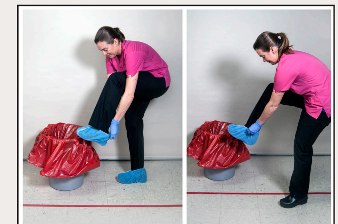
Remove shoe cover stepping over the red line into the decontamination area. Then pick-up your other foot and remove shoe cover and step into decontamination area. Place in red biohazard bag.