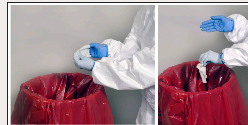
Remove and dispose of OUTER pair of gloves in red biohazard bag. If only wearing a single pair of gloves, replace with a new pair of gloves.