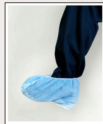
Put on shoe covers