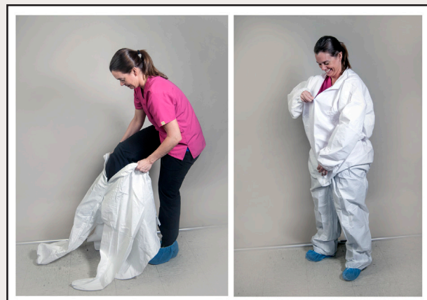
Wear an Isolation Suit. Step into your isolation suit one leg at a time and zip all the way to the top.