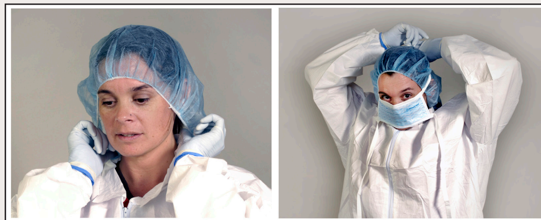
Put on your hair cover (if hair hangs below collar) and mask (when applicable).