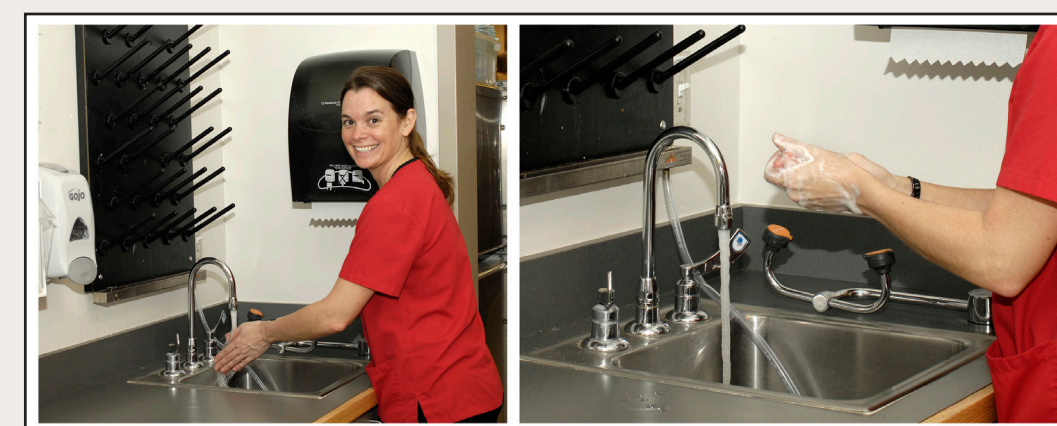
Wash hands using the sink in the main treatment room.