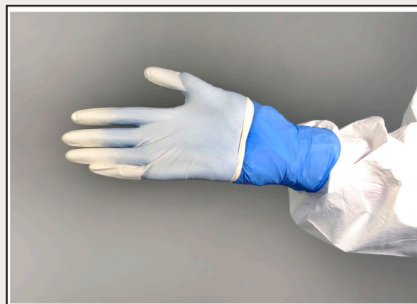
Put on your OUTER pair of gloves (they can be any color). *Note: At clinician discretion 1 pair of gloves may be worn to provide optimal care for patients.