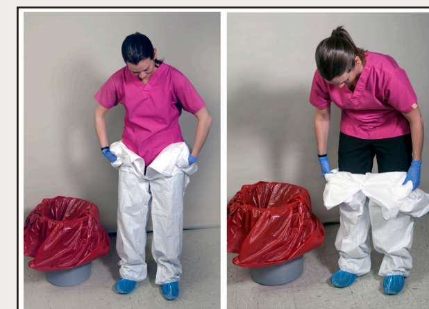
Remove isolation suit ensuring the exterior of the suit does not come into contact with your clothing or skin and place in the red biohazard bag.