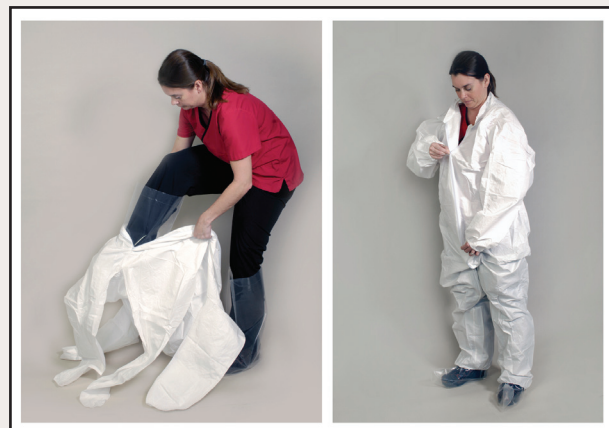
Wear an Isolation Suit. Step into your isolation suit one leg at a time and zip all the way to the top.