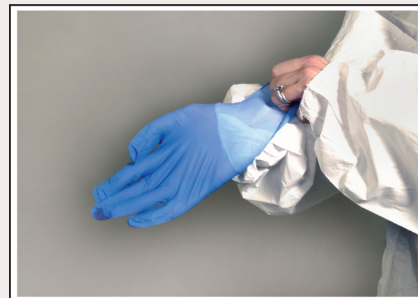
Put on your INNER pair of gloves (they can be any color). Make sure they go OVER the cuff of your isolation suit sleeves.