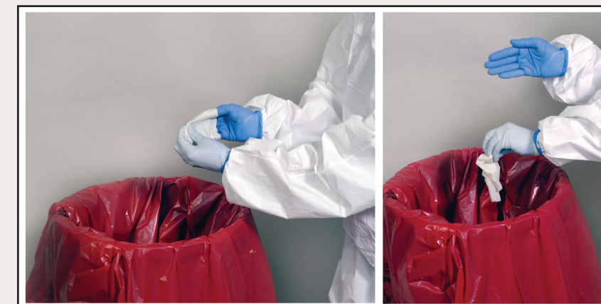
Remove and dispose of OUTER pair of gloves in red biohazard bag.