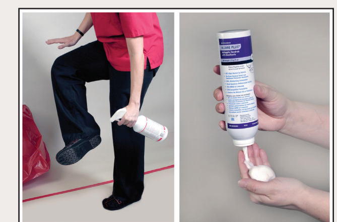
Spray bottom of shoes with Accel as exiting the decontamination area and transitioning to the clean area. Disinfect hands with alcohol foam.