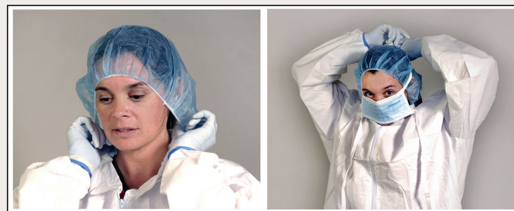
Put on your hair cover (if hair hangs below collar) and mask (when applicable).