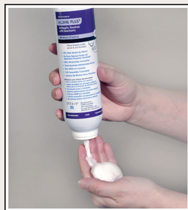
Disinfect hands with alcohol foam.