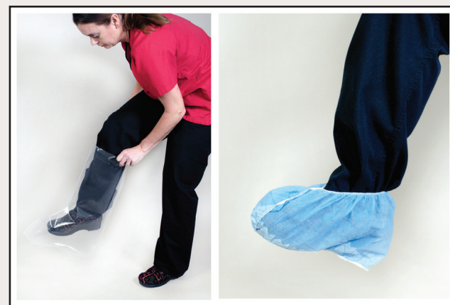
Put on your boots. Shoe covers may be worn over the top of plastic boots at your discretion.