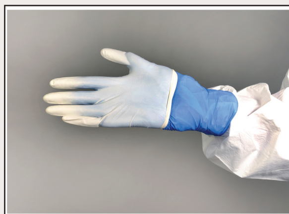
Put on your OUTER pair of gloves (they can be any color).