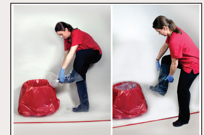
Remove one boot stepping over the threshold into the decontamination area. Then pick up your other foot to remove boot and step into decontamination area. Place in red biohazard bag.