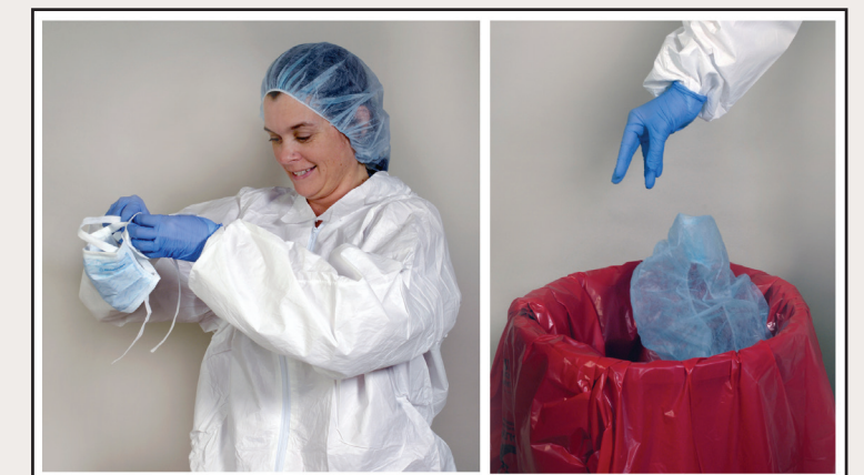
Remove your face mask, hair cover and face shield (if applicable) and place in the red biohazard bag.