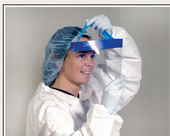
Put on your face shield if required. Cases requiring a face shield are indicated in the Online Infectious Disease resource.