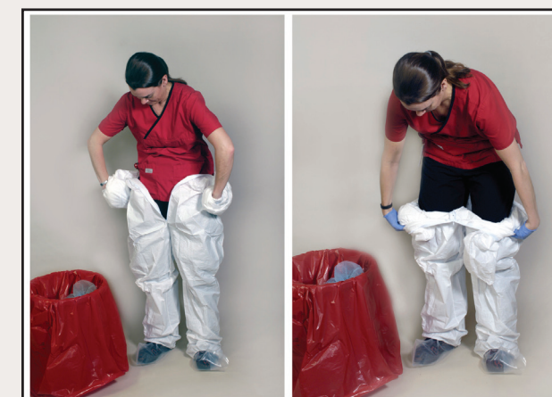
Remove isolation suit ensuring the exterior of the suit does not come into contact with your clothing or skin and place in the red biohazard bag.